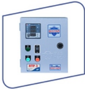
RTP 3 SP