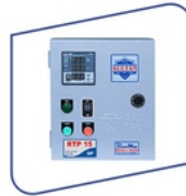
RTP 15 SP