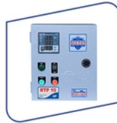
RTP 10 SP