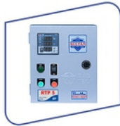
RTP 5 SP